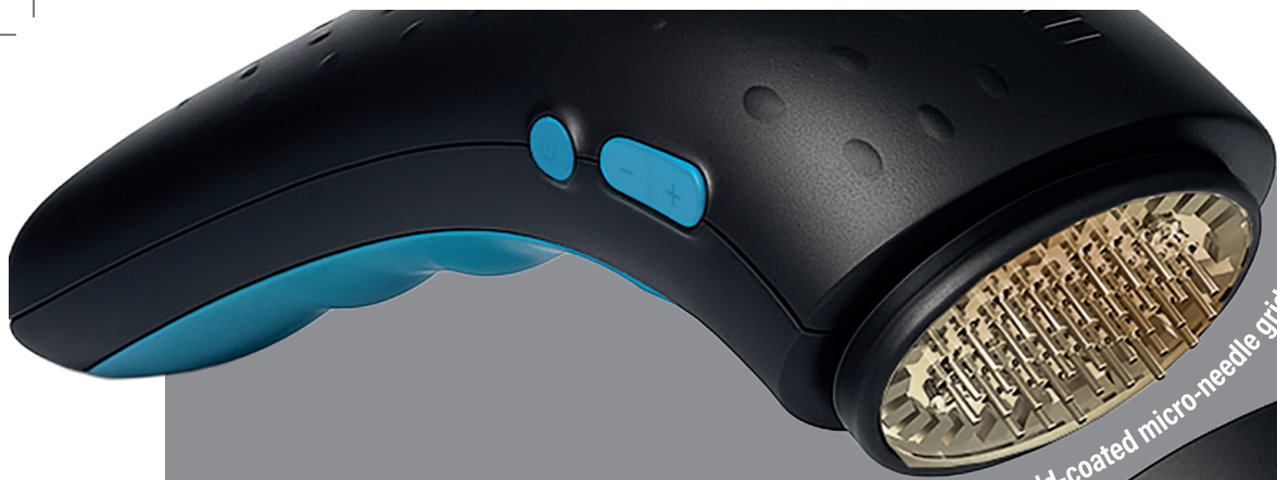
36 gold-coated micro-needle grid